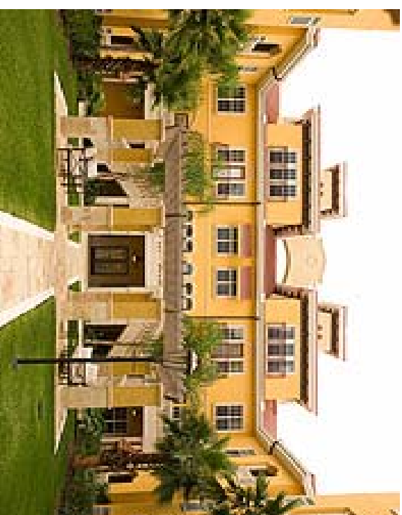
Casa Bella in Tampa