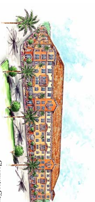
Clearwater City Homes